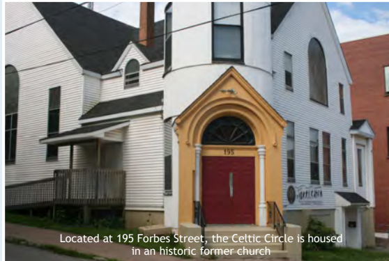
Located at 195 Forbes Street, the Celtic Circle is housed in an historic former church

The Celtic Circle has also joined forces with Glasgow Square last spring to launch the inaugural Music Shapes New Glasgow Series and was an off-site venue for aspects of the 2011 New Glasgow Riverfront Music Jubilee.