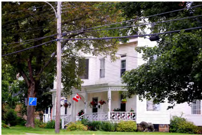
Carmichael-Stewart House Museum is in full bloom this summer. The Frank Calder Historic Garden is also available this summer for viewing behind the main building.