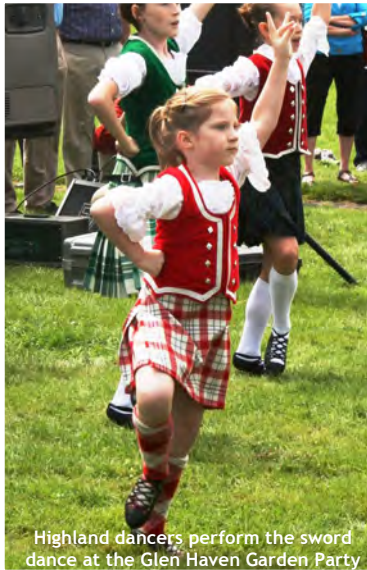
Highland dancers perform the sword dance at the Glen Haven Garden Party

New Glasgow Development Commission's Tartan with a Twist celebration in the downtown core. Featured events included music, a barbecue, and antique car show.