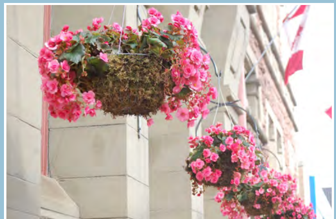
Vibrant flower baskets enhance New Glasgow Town Hall.