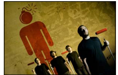
Alert the Medic