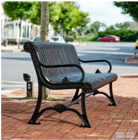
Steel Bench $5,000 donation

Once installed, the commemorative bench becomes the property of the Town of New Glasgow and will receive ongoing maintenance as deemed appropriate by Town Staff. A 50% deposit must accompany your commemorative bench application. The balance remaining is due upon plaque approval and order will take place once final payment is received.