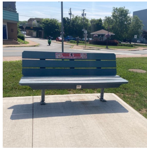
Recycled Bench $2,500 donation